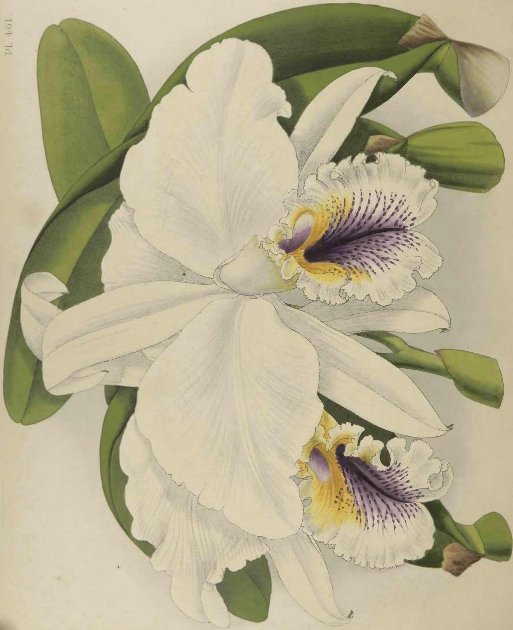
CATTELEYA MOSSII, REINECKIANA