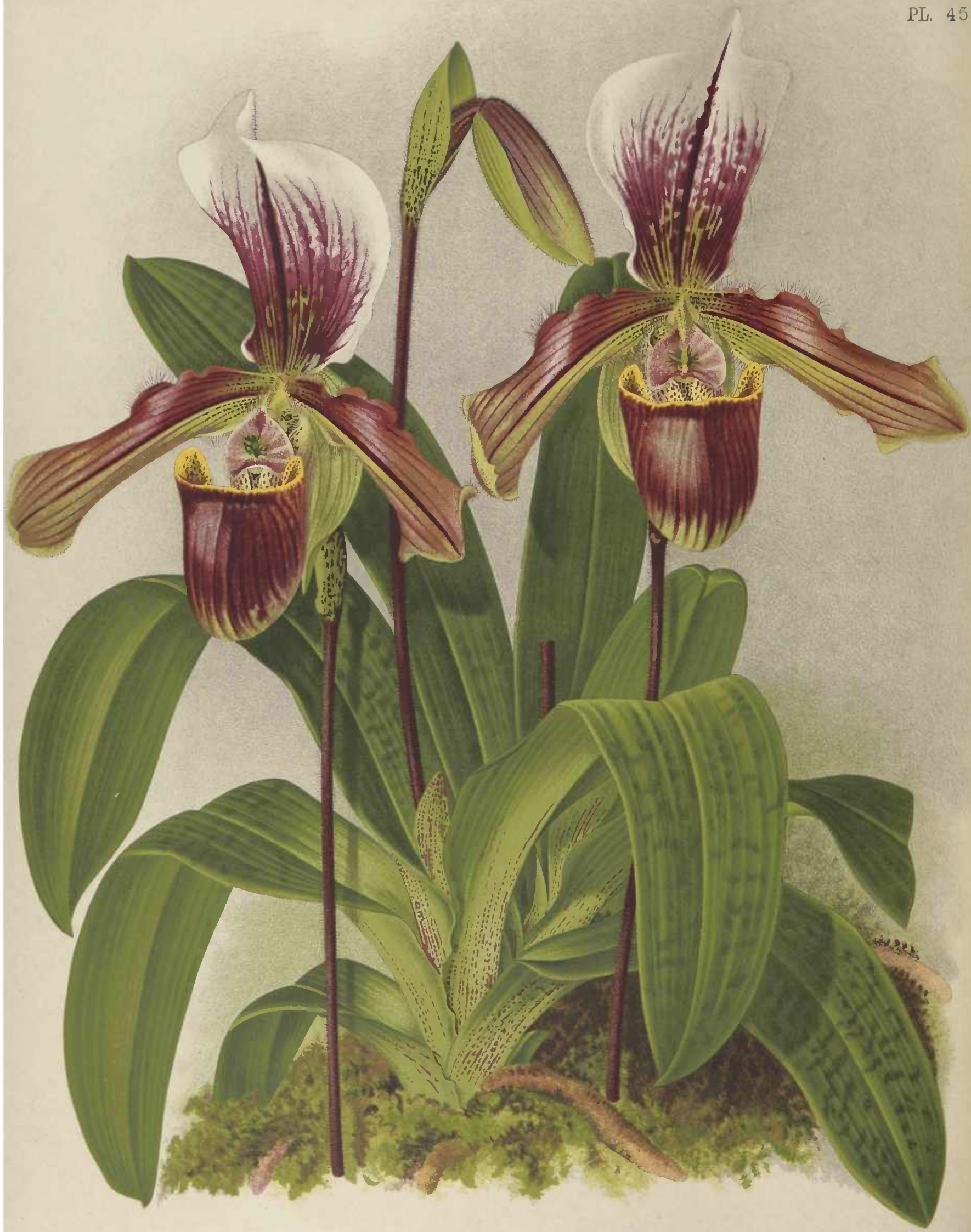
CYPRIPEDIUM PITCHERIANUM (WILLIAMS' VARIETY)